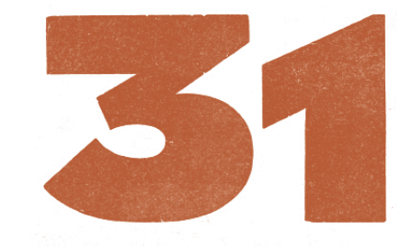
The ultimate New Year's Eve party is back. Join us and celebrate as we say a fond farewell to 2017 and hello to 2018. Indulge in a delicious buffet and party into the early hours with bubbles at midnight. DJ 8pm-late. Tickets £40pp, available on the website.

Sorry, we're closed. We believe everyone should have Christmas Day off to stuff themselves with turkey and then gently nod off in front of the fire.