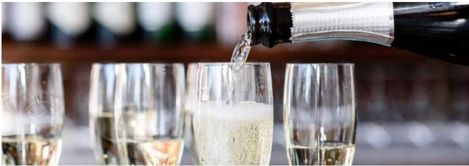
TABLE WINE & TOAST FIZZ*